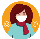
Shortness of Breath